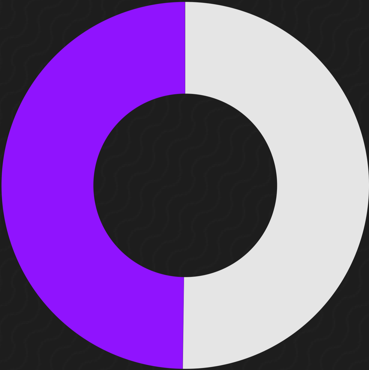
Are Consumers Willing to Pay?

Twenty-one percent of consumers said that they would pay a monthly subscription to access all new movie releases.